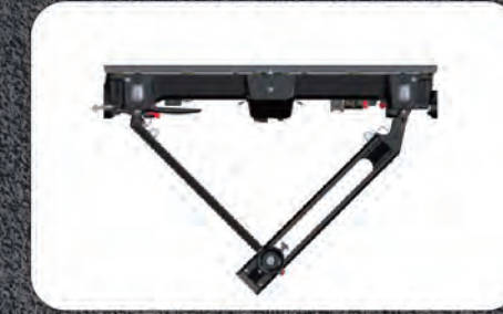
with Touring Frame