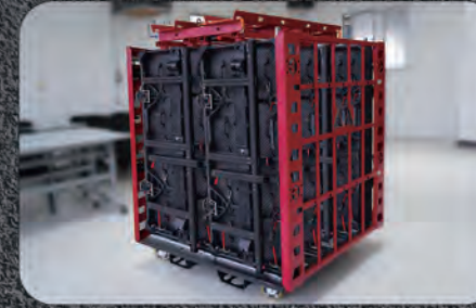
Packed by Dolly Cart