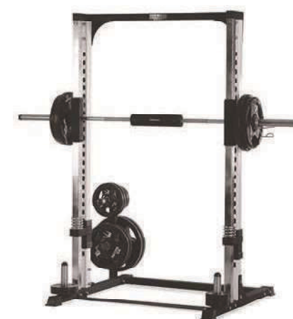
Main tube: Assembly size: Ctn Size: