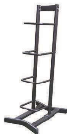
Main tube: Assembly size: Ctn Size: