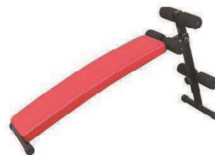
Main tube: Assembly size: Ctn Size: