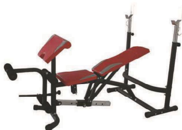
Main tube: Assembly size: Ctn Size: