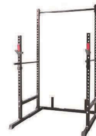
Main tube: Assembly size: Ctn Size: