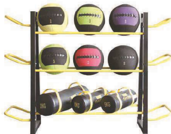
Main tube: Assembly size: Ctn Size: