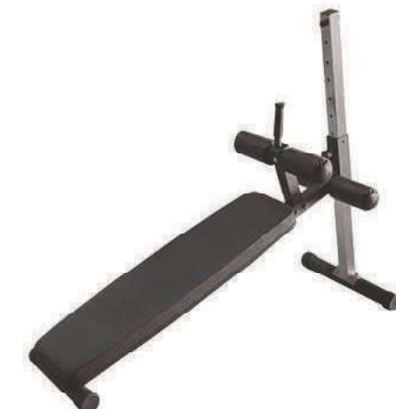
Main tube: Assembly size: Ctn Size: