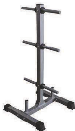
Main tube: Assembly size: Ctn Size: