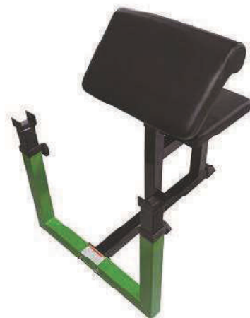
Main tube: Assembly size: Ctn Size: