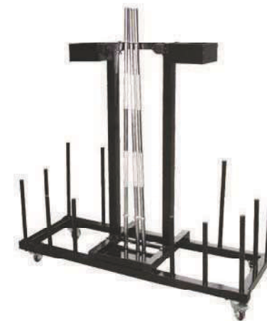
Main tube: Assembly size: Ctn Size: