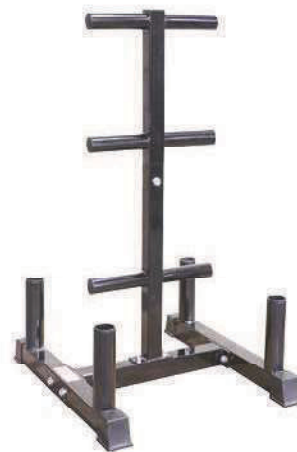
Main tube: Assembly size: Ctn Size: