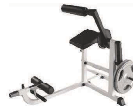
Main tube: Assembly size: Ctn Size: