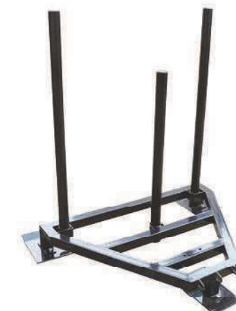
Main tube: Assembly size: Ctn Size: