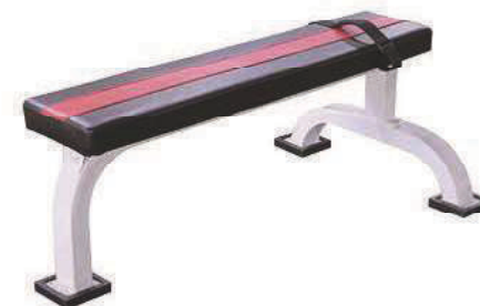
Main tube: Assembly size: Ctn Size: