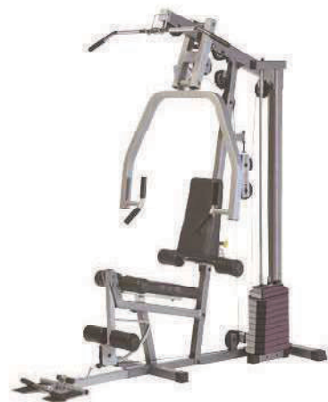
Main tube: Assembly size: Ctn Size: