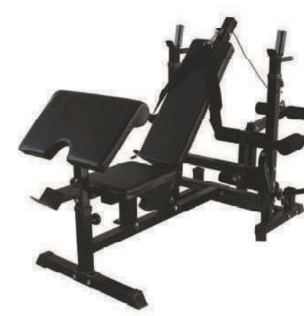
Main tube: Assembly size: Ctn Size: