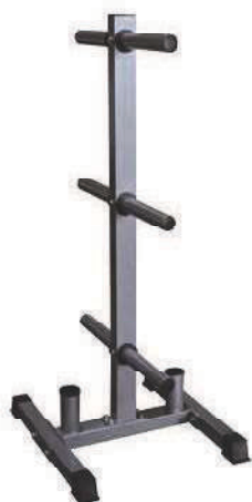
Main tube: Assembly size: Ctn Size: