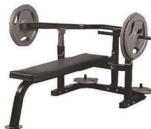
Main tube: Assembly size: Ctn Size: