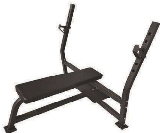
Main tube: Assembly size: Ctn Size: