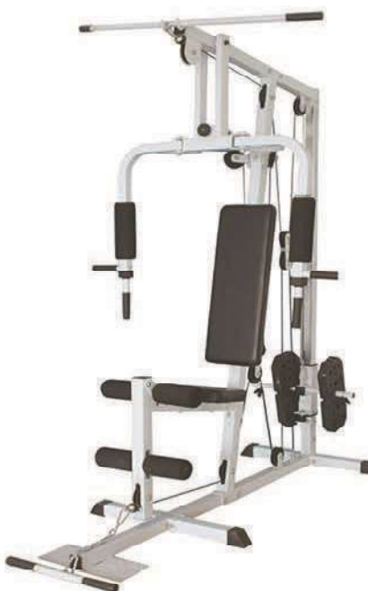
Main tube: Assembly size: Ctn Size: