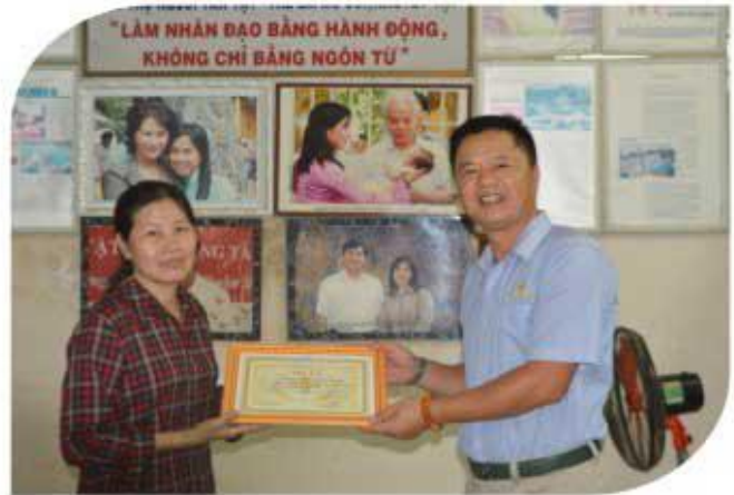
福利院院长授予感谢信 Receive letter of thanks from dean of the welfare house