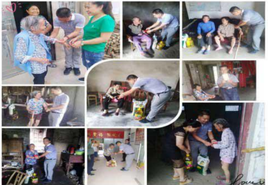
慰问江西芳溪村贫困老人 Charity activity in JiangXi visiting needy elderly