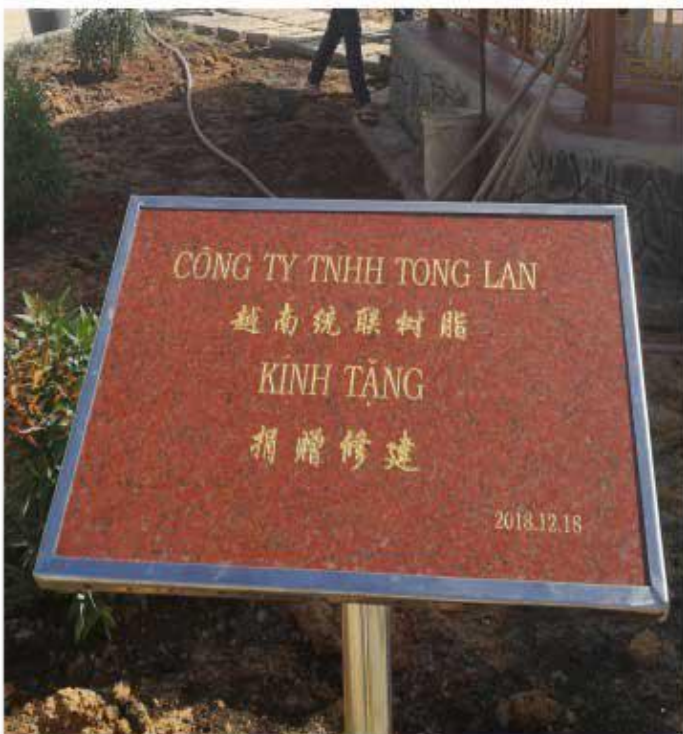
越南統聯公司捐建凉亭 Pavilion built with donation from Tonglan company