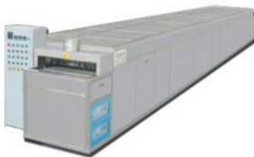
超聲波水洗機 Ultrasonic Washing Machine