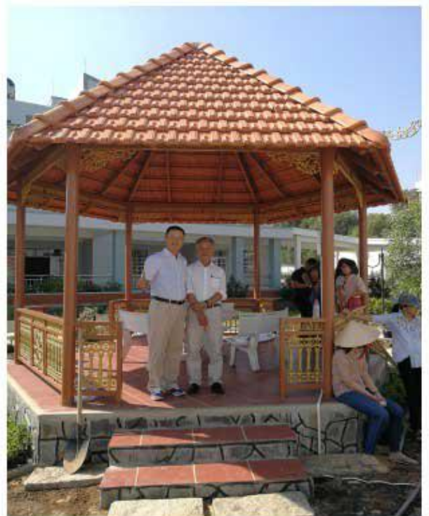
越南統聯公司捐建凉亭完工 Tonglan GM and welfare house dean celebrate the completion of pavilion