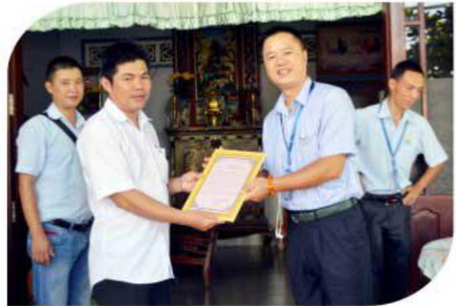
越南前江政府工作人员向蒲总授予感谢信 Receive letter of thanks from Tien Giang government of Vietnam