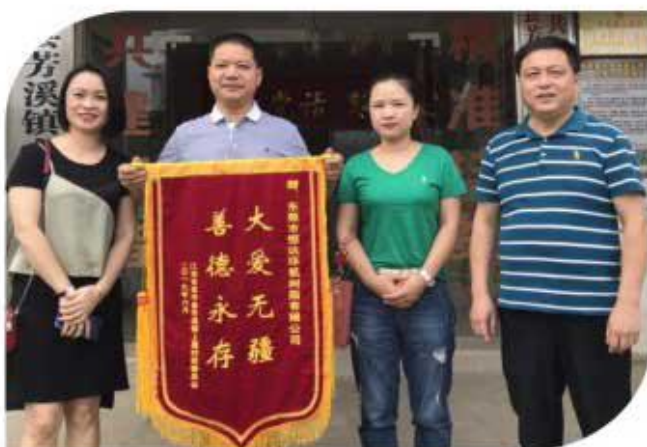
2019年6月江西公益活动中村委授锦旗 Receive banner from village committee in JiangXi