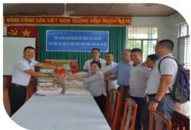
公司高管慰问孤儿院 Top management of the company visit orphan asylum in Vietnam