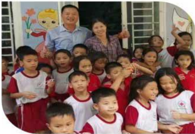
蒲总慰问越南平阳省儿童福利院 Tonglan GM visit welfare house in Binh Duong, Vietnam