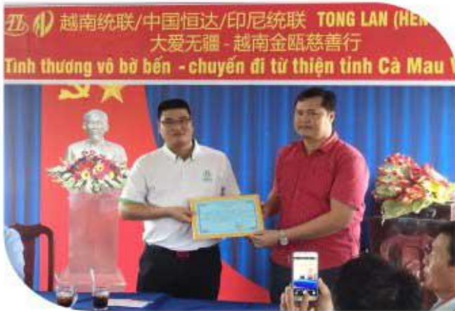
越南金瓯慈善活动 Charity activity in Ca Mau in Southern Vietnam