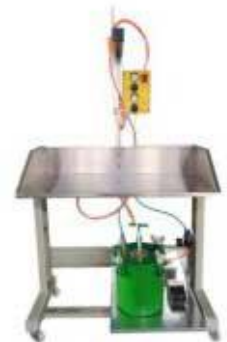
氣動自動噴膠機 Air-Powered Automatic Adhesive Sprayer